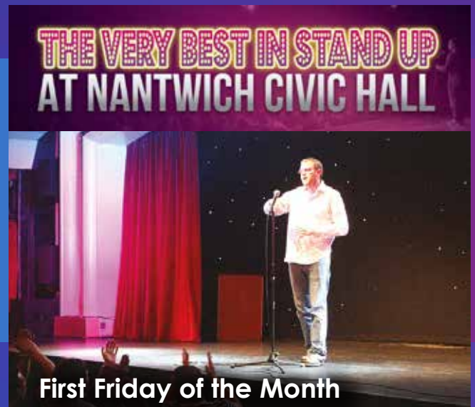
First Friday of the Month