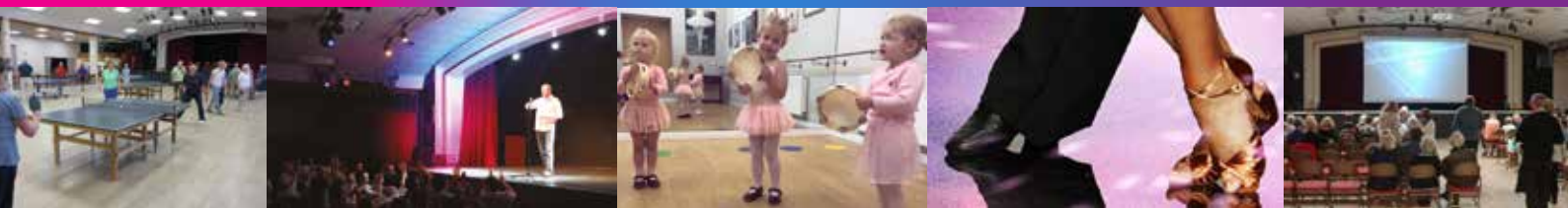
Table Top Sales 8am - noon Table Tennis 2pm - 4.30pm Social Ballroom, Latin & Popular Sequence Dancing 7.30pm - 10.30pm