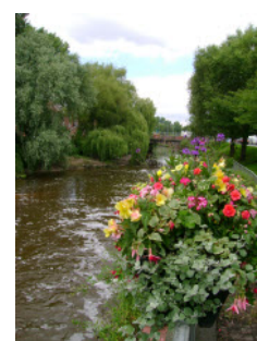
In Bloom basket