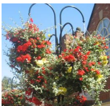
Nantwich in Bloom