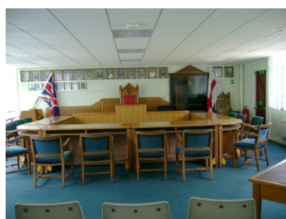
Town Council offices