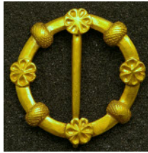
The Hurlston Brooch.