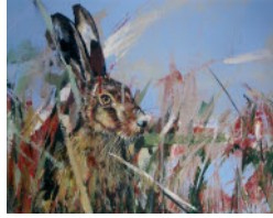
Painting by Annabel Thornton.

Please take a look at the Museum web site www.nantwichmuseum.org.uk or telephone 01270 627104 for events and opening times.