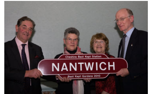
Award for 'Best Kept Garden 2010'

Since we became involved in work on the Station it has attracted accolades year on year. In January we gained the Best Kept Gardens award from the Cheshire Best Kept Stations group.