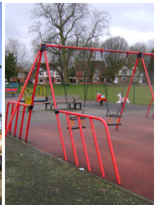
Town Council may take over ... Civic Hall ... The Gables ... Play areas.