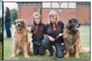
Allsorts Dog agility team