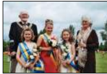
Community Princess & attendants