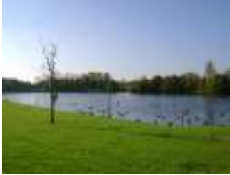
A path would help people enjoy the Lake.