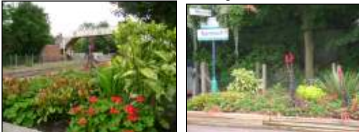
Floral Improvements at the Station.

Co-operation has also come from the owner of the newly refurbished Indian restaurant next to the station, NatraJ. The next task is to keep up the pressure to create much needed car parking on land next to the station – we're working on it!