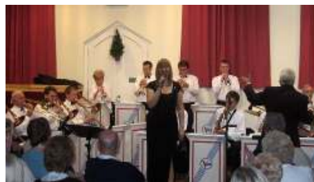
The VCO Big Band will be making the evening go with a swing

If you would like to attend what is certain to be a night to remember, please contact the Town Clerk on 01270 619224 or email nantwichtc@nantwichtowncouncil.gov.uk for tickets at a very reasonable price £20 per person.